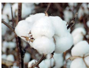
The burst cotton boll with protruding seed fibres.

Cotton yarn is manufactured from the long seed fibres of the cotton boll.